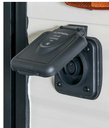
LE comes standard with solar and backup camera prep.