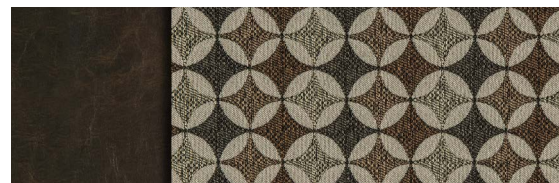
French Roast Décor